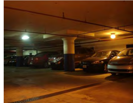
LED on left, HPS on right

The tabulated energy savings of 50 percent reflects the LED system operating at full power, but at the DOL garage, each new luminaire achieves additional savings by employing a motion detector that dims it when the space is unoccupied. On average, DOE estimates that each LED luminaire will operate at full power for just 6 hours per day and at low power 18 hours per day, resulting in an overall energy savings of more than 75 percent relative to the HPS system. What’s more, operating the LED system in a dimmed state greatly increases its lifetime compared to driving it at full power. Dimming capability, therefore, offers multiple energy and economic benefits to the LED system.