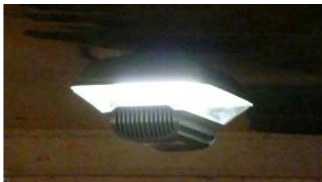
The VizorLED installed at DOL

The installed product at this GATEWAY site is VizorLED by Philips Wide-Lite, which was a 2009 “Best in Class” winner of the Next Generation Luminaires™ competition. This U.S.-made product features indirect optics to reduce potential glare and control options including a dimmable driver and programmable integral motion detector.