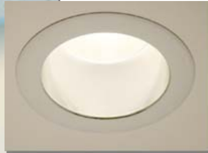
Cree LR4, Lighting for Tomorrow Winner, Downlight Category