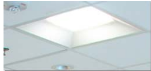
Cree LR24, Honorable Mention for Efficacy and Innovation