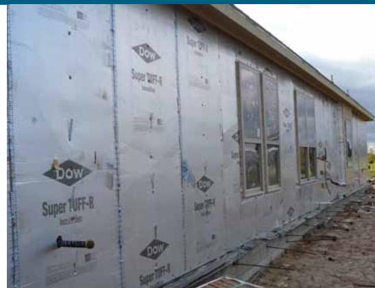
David Weekley Homes covers the building exterior with 1-inch of rigid foam XPS providing a continuous air barrier and thermal break for the building envelope.