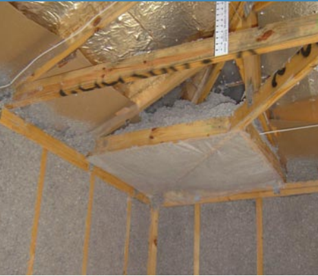
Walls and ceilings are insulated with naturally bug-resistant Green Fiber blown-in cellulose insulation – R-30 in the ceiling and R-13 in the walls.