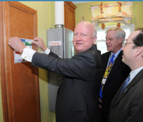
U.S. Dept. of Energy Secretary Samuel W. Bodman secures the first EnergySmart label to the Bimini electrical panel box.